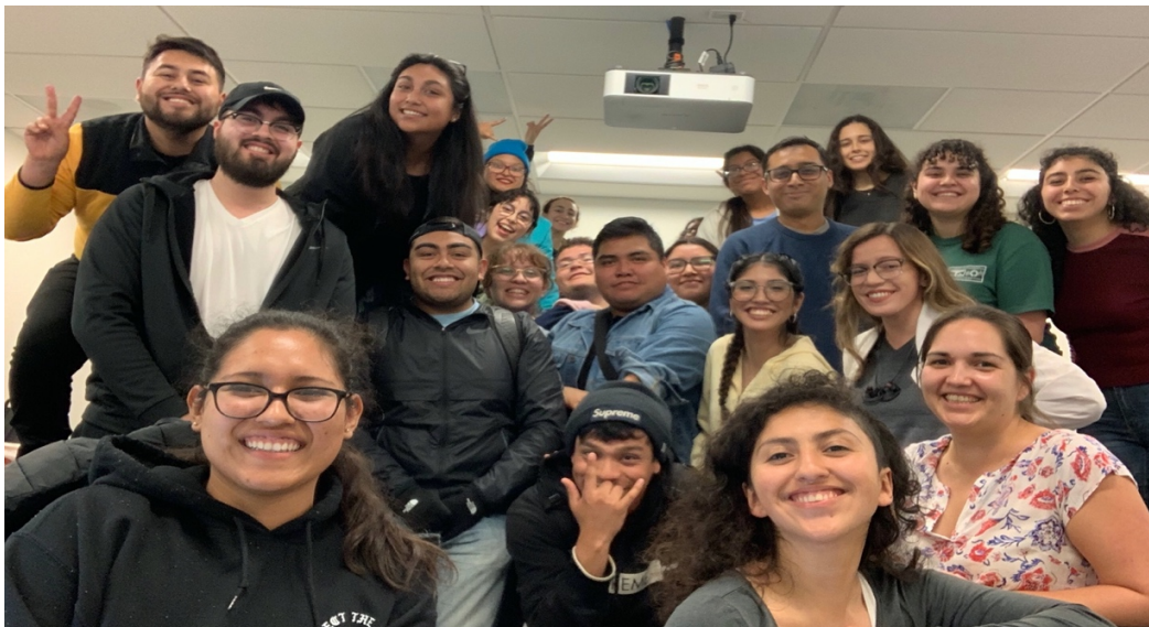
[Photo: Chicano/Latino Studies majors enrolled in our two-quarter Research Seminar series.]

Scholars emphasize the impact immigration policies have on undocumented populations, however, few studies explore their impact on U.S. citizens in mixed-status families. Drawing on 8 in-depth interviews with Latinx U.S. citizens from mixed-status families, I identify how undocumented loved ones’ legal status shapes U.S. citizens’ legal consciousness. Although Latinx U.S. citizens have the protection of their documented status, I argue that inclusive and exclusive limitations are raised within legal systems, citizenship, and educational institutions. My findings indicate that systemic barriers are prevalent for U.S. citizens in mixed-status families, specifically, when the U.S. citizen internalizes their undocumented loved ones’ unequal rights and unprotective legal status as their own social issues. These exclusionary boundaries cause Latinx U.S. citizens in mixed-status families to question whether they fully belong into society, and reveal the limitations associated with their citizenship. I suggest that immigrant incorporation and inclusiveness are critical components in recognizing how undocumented status affects U.S. citizens in mixed-status families.